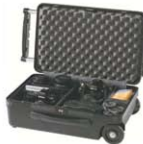
PC II Divider Case