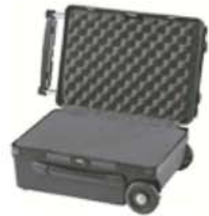
Elite Foam Case