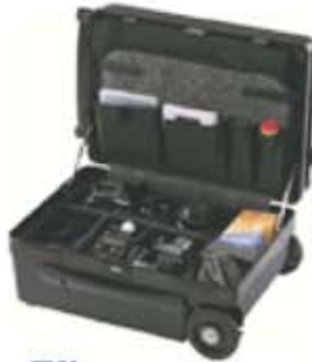
Elite Deluxe Divider Case