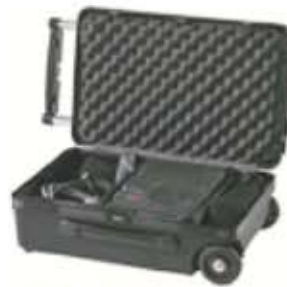
PC II AV Case