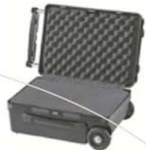
Elite PE Polyethylene Exterior