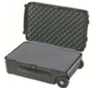
PC II Foam Case