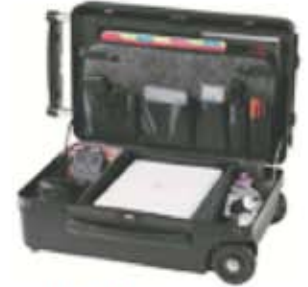
PC II Computer Case