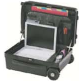
Elite Computer Office Case