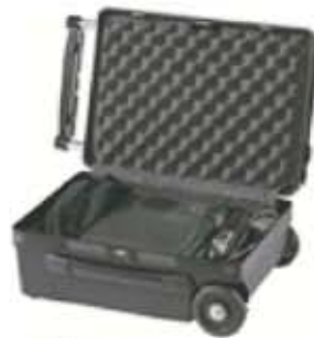
Elite AV/Computer Case