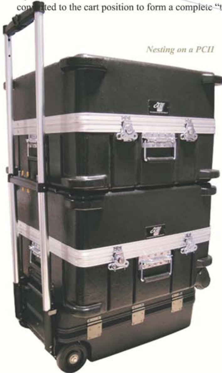
Nesting on a PCII

Up to 3 Stowaway 20-20 cases will nest on top of a Porter Case PC II or Elite model when converted to the cart position to form a complete "travel system" for the professional frequent traveler.