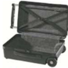
PC II Standard