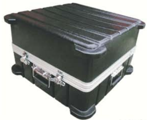
Wheel & handle option