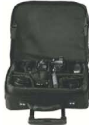
Softie Photo 160