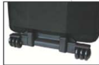
Six inline skate wheels (3per side)