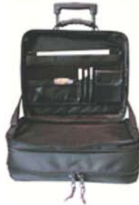
Softie Office 170