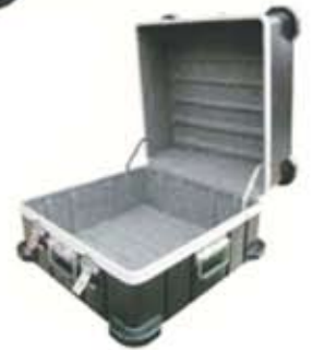
Optional interior divider