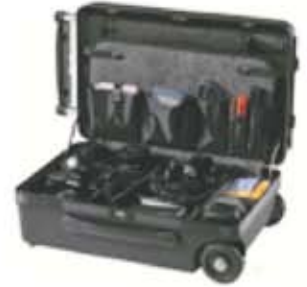
PC II Deluxe Divider Case