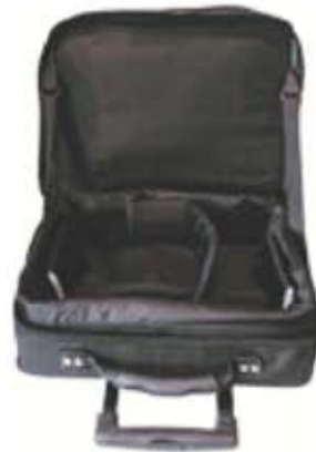
Softie Projector 150